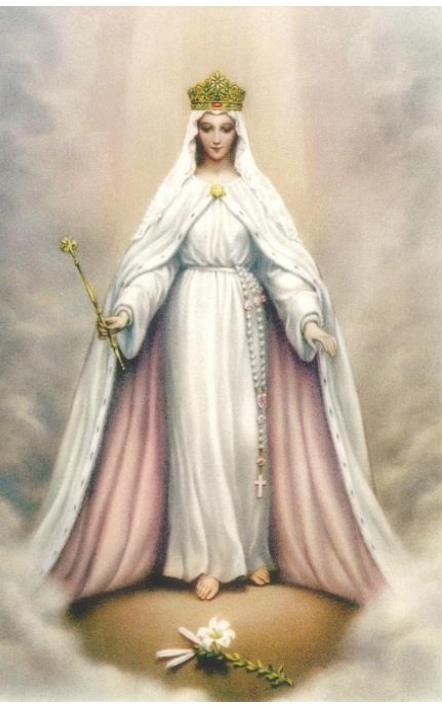
Our Hope Mary Immaculate Queen of the Universe