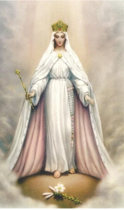
Our Hope Mary Immaculate Queen of the Universe