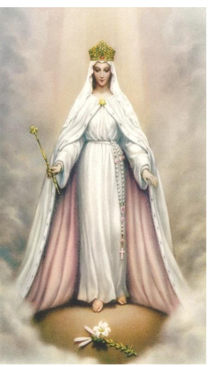
Our Hope Mary Immaculate Queen of the Universe

All praise and all thanksgiving be every moment Thine! An indulgence of 300 days. An indulgence of 3 years, when this ejaculation is recited in the presence of the Blessed Sacrament. A plenary indulgence on the usual conditions, if the daily recitation of this ejaculation is continued for a whole month