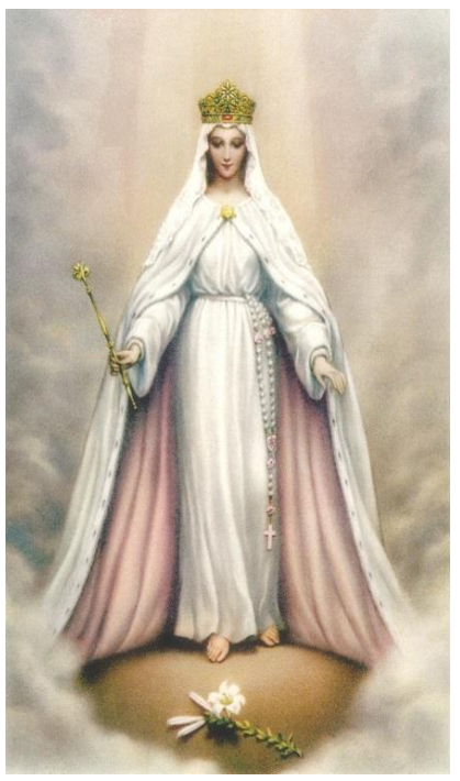
Our Hope Mary Immaculate Queen of the Universe