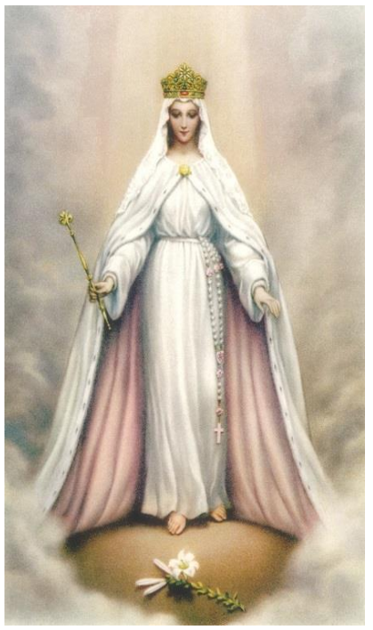
Our Hope Mary Immaculate Queen of the Universe

. A Woman Clothed with the Sun, from pages 193