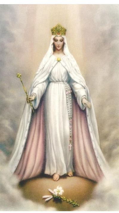
Our Hope Mary Immaculate Queen of the Universe

The Liturgical Year, XIV, Book V, Pages 105-106