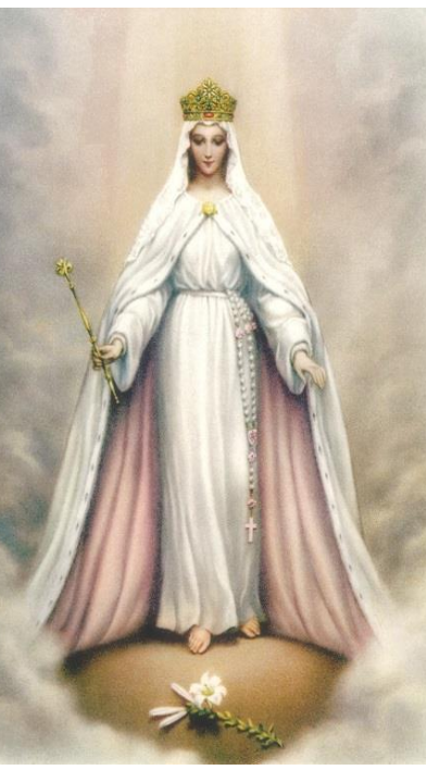
Our Hope Mary Immaculate Queen of the Universe

Lives of the Saints, pages 349-350, and newadvent.org